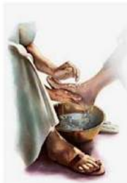
"You should wash each other's feet" (John 13:14).